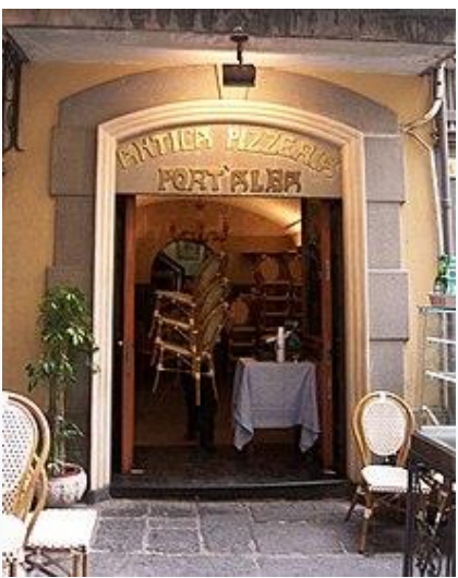
Antica Pizzeria Port'Alba in Naples, which is widely believed to be the world's first pizzeria.

According to documents discovered by historian Antonio Mattozzi in the State Archive of Naples, in 1807, 54 pizzerias existed; listed were owners and addresses. In the second half of the nineteenth century the number of pizzerias increased to 120.