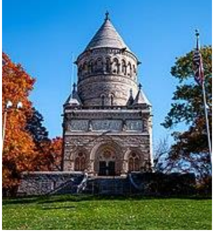
Garfield Memorial at Lake View Cemetery in Cleveland, Ohio

At the 1880 Republican National Convention, delegates chose Garfield, who had not sought the White House, as a compromise presidential nominee on the 36th ballot. In the 1880 presidential election, he conducted a low-key front porch campaign from "Lawnfield," his home in Lake County, and narrowly defeated the Democratic nominee. Winfield Scott Hancock. Garfield's accomplishments as president included his assertion of presidential authority against senatorial courtesy in executive appointments, a purge of corruption in the Post Office, and his appointment of a Supreme Court justice. He advocated for agricultural technology, an educated electorate, and civil rights for African Americans. He also proposed substantial civil service reforms, which were passed by Congress in 1883 as the Pendleton Civil Service Reform Act and signed into law by his successor, Chester A. Arthur.