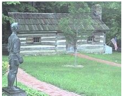
Replica of the log cabin in Moreland Hills, Ohio, where Garfield was born

James Abram Garfield (November 19, 1831 – September 19, 1881) was the 20<sup>th</sup> president of the United States, serving from March 1881 until his assassination in September 1881. A lawyer and Civil War general, Garfield served nine terms in the United States House of Representatives and is the only sitting member of the House to be elected president. Before his candidacy for the presidency, he had been elected to the U.S. Senate by the Ohio General Assembly—a position he declined when he became president-elect.