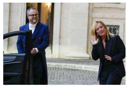
Giorgia Meloni, the Prime Minister of the new Italian government, in Rome, October 2022

is called a floating-rate loan, where the level of interest paid back on the loan is varied, not fixed.