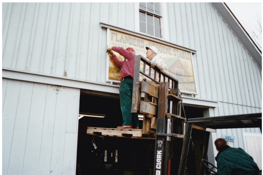
Putting up the sign, painted by Babe Sargent in 1981, at the Museum