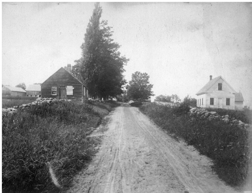
North Road near Perkins Pond Road past 2 schoolhouses—old and newer #3.