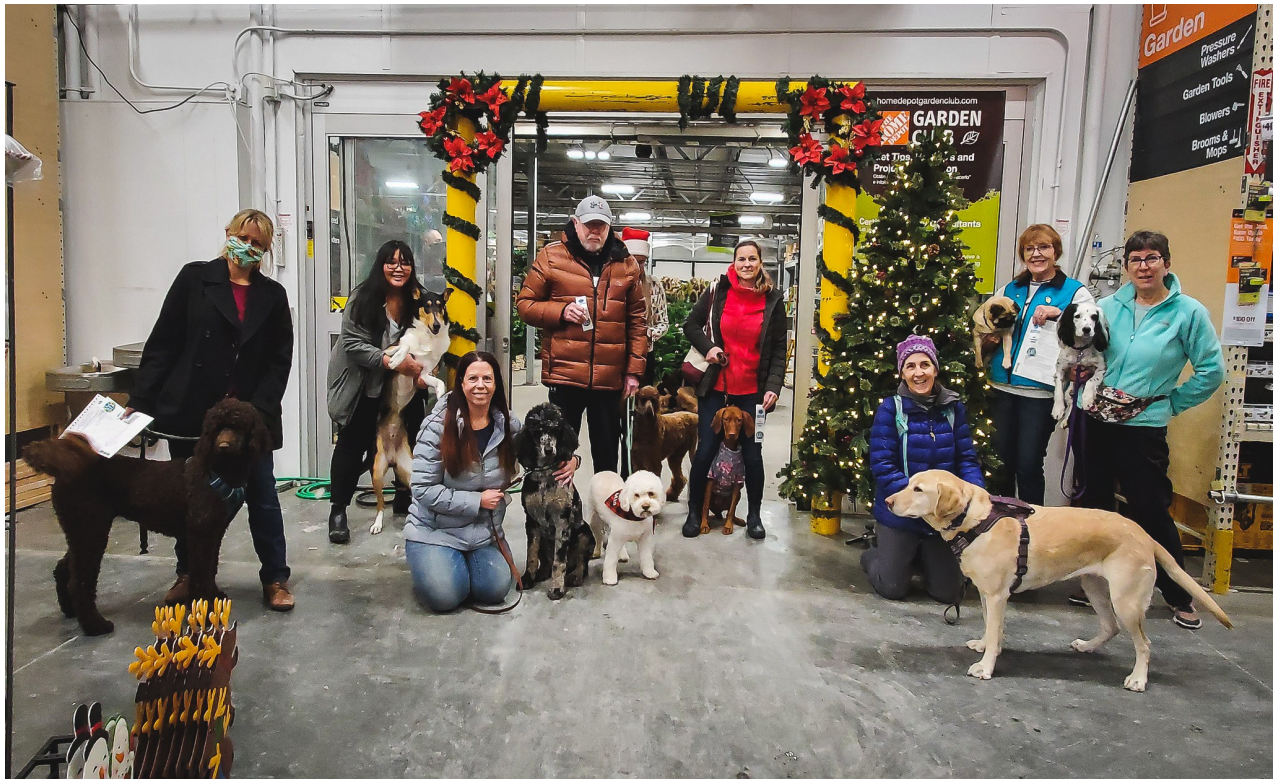
Elton and Russett both earned their CGCA. Elton (Collie) on the left and Russett (Pug) on the right.