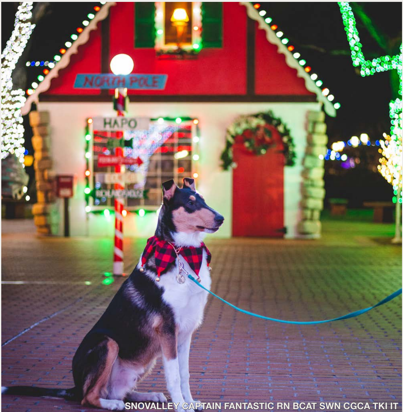
SNOVALLEY CAPTAIN FANTASTIC RN BCAT SWN CGCA TKI IT