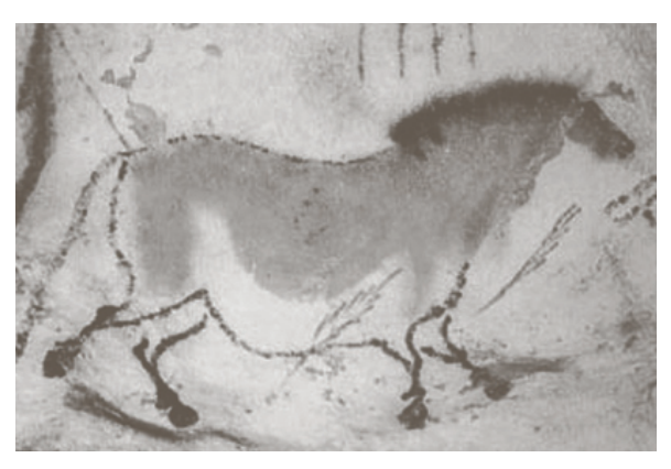
A cave painting from the French Lascaux caves which contain 16,000-year-old Paleolithic art.

You belong to haplogroup R1b , The Artisans, who first arrived in Europe from west Asia about 35,000-40,000 years ago at the dawning of the Aurignacian culture. This culture was remarkable for its subtle, yet significant, technological progress. While early