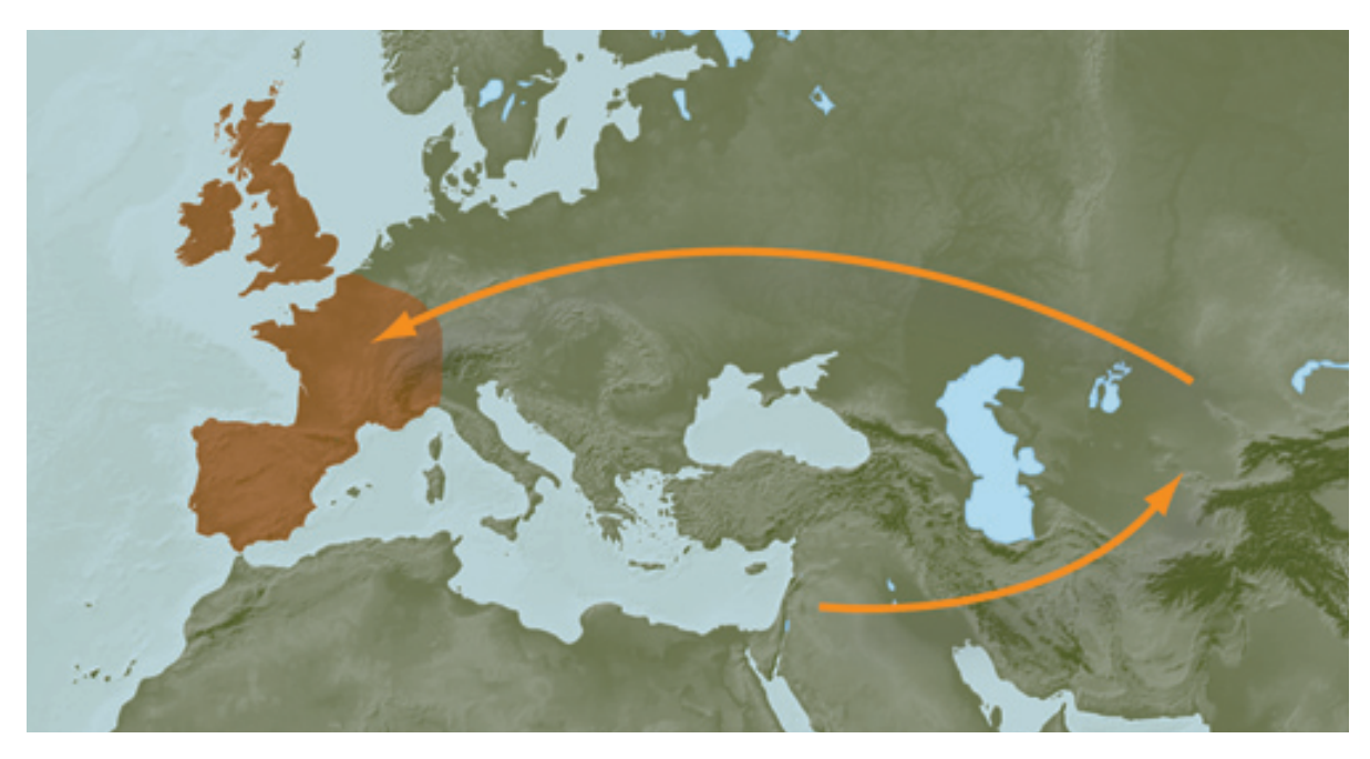
Your ancient ancestors likely traveled this path—settling for various periods of time at points along the way.

Aurignacian peoples collected flint for tools at random, they later advanced and managed their resources with sophistication, using a single stone core to shape flint tools as needed. Aurignacian decorative beads and jewelry could also be the first sign we have of the uniquely human quality of self-awareness and adornment. Additionally, some anthropologists believe that the Aurignacian culture was the first to paint. The people of this time period left behind fascinating cave paintings in France, Spain and Portugal.