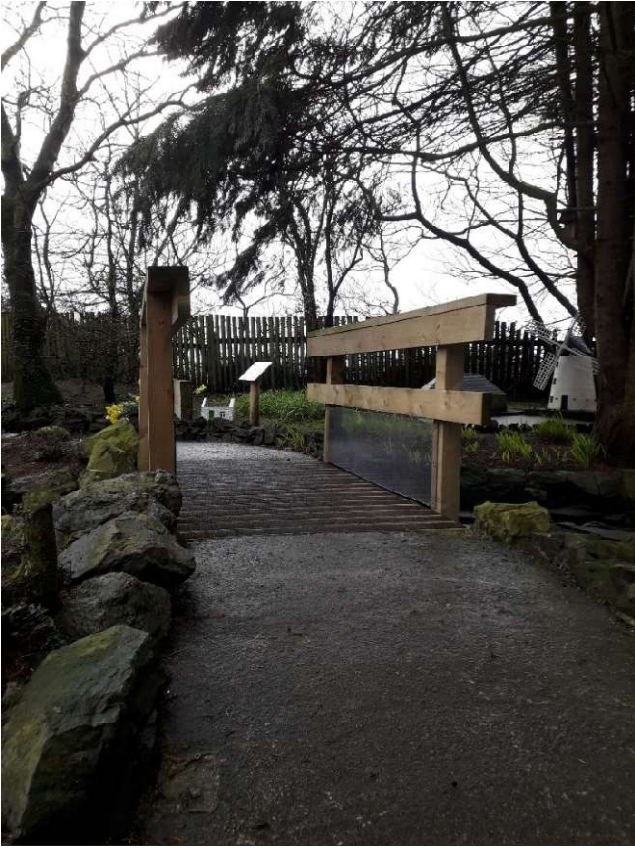
Pedestrian bridge in Model Village gardens