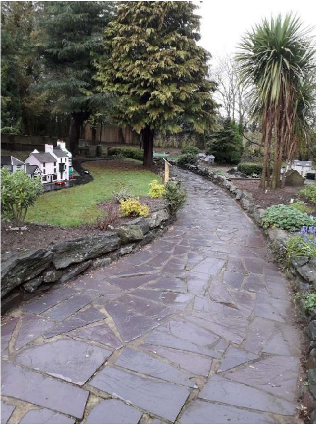
Model Village path