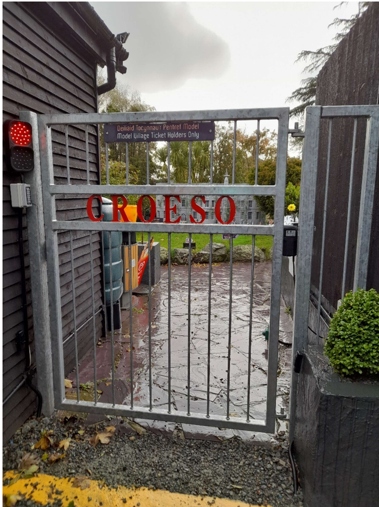
Gate entrance to Model Village from Ticket Office window