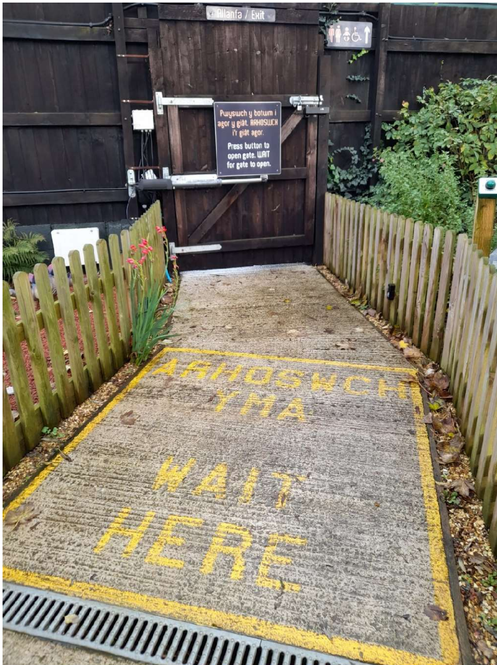
Model Village exit gate