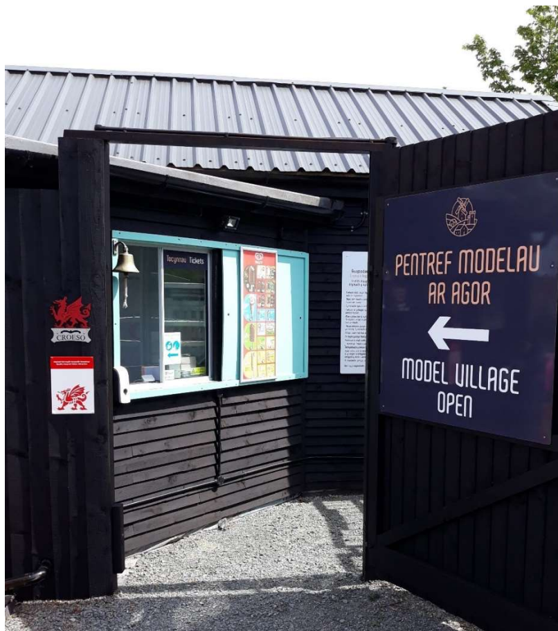
Entrance Gate to Ticket Office Window