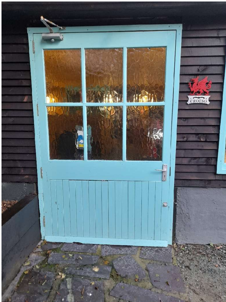
Entrance to Cafe from Model Village