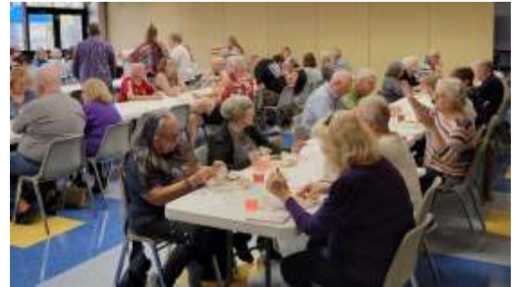
IF YOU COOK IT, THEY WILL COME... ANOTHER CONSECUTIVE YEAR SOLD OUT!