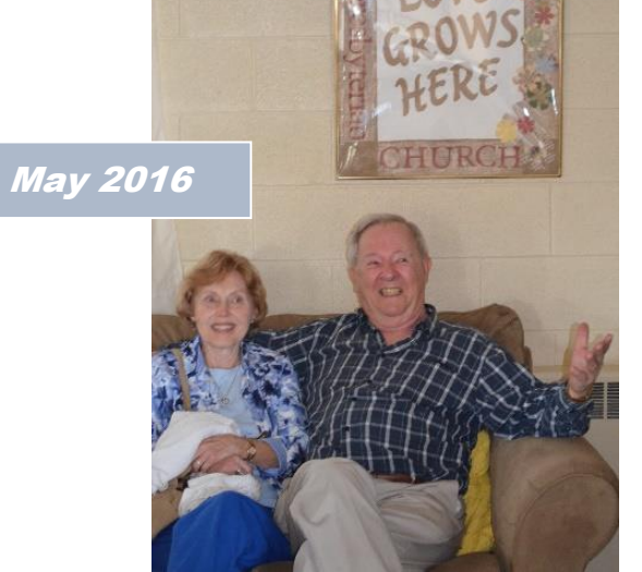
High Tea 2013