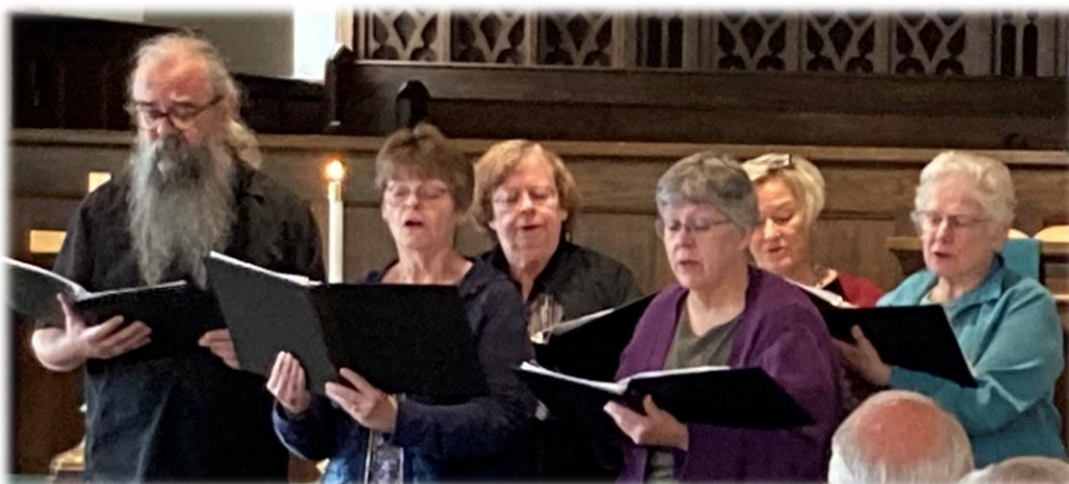
GLORY TO GOD