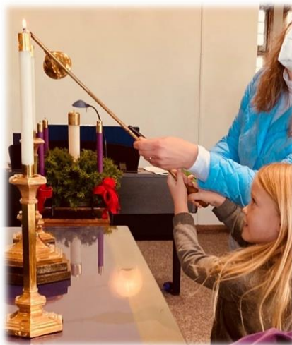
HOPE, LOVE, JOY, PEACE