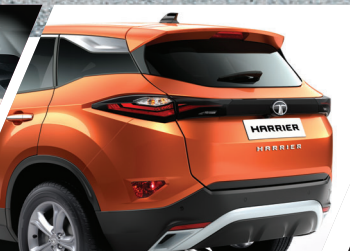
Stunning Impact Design 2.0 Extraordinary Exteriors and Luxurious Interiors