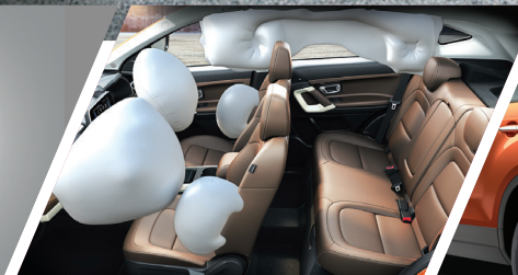
Top-of-the-Line Uncompromised Safety 6 airbags, ABS with EBD, ESP with added functionalities