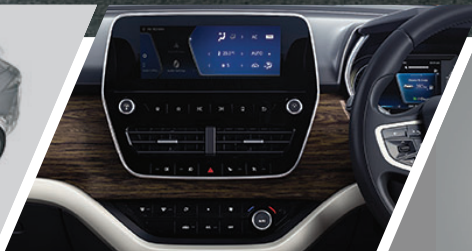
Future Ready Connectivity and Infotainment Floating Island 22.35 cm (8.8") Touchscreen Infotainment with JBL Acoustics