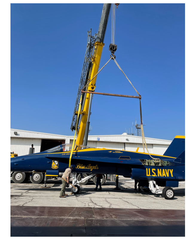
Loading at NAS Pensacola