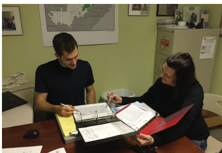
Desk Audit being conducted with auditee

Request your audit date in a timely manner, at least six weeks prior to the end of the growing/harvest/packing/transport season for the earliest crop for which you are seeking certification, and with plenty of time before your current audit (if any) expires. To schedule an audit, complete the Request for Audit Services (Form SC-237A) and a signed Agreement for Participation in the GAP/GHP Audit Verification Program Form (Form SC651) and scan or email the completed forms to the appropriate contact. Quick Links to the forms are located in Appendix A. An example of a completed Request for Audit Services (Form SC-237A) is located in Appendix B.