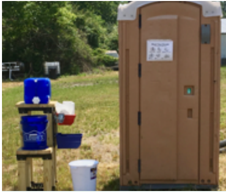
Adequate restroom facilities and hand wash stations with signage

Worker health and hygiene are important in ensuring that the employees do not contaminate product. Your operation’s personal hygiene and handwashing policies not only apply to you and your employees, but to visitors, buyers, product inspectors, auditors and other personnel in product handling areas, including the field. The food safety responsible individual must ensure compliance with these policies by all persons in produce handling areas, including an auditor.