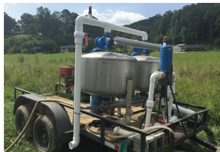
Example of a portable water treatment system used for irrigation

The standard does not specifically dictate the target organism that your production water should be tested for; the acceptable limits for any target organism; or the frequency of testing. You must make these decisions based on your water risk assessment, and any regulatory requirements applicable to your farm. For outdoor production systems, generic E. coli testing, with results reported with a numeric count, not merely presence/absence, is likely the best target organism to measure.