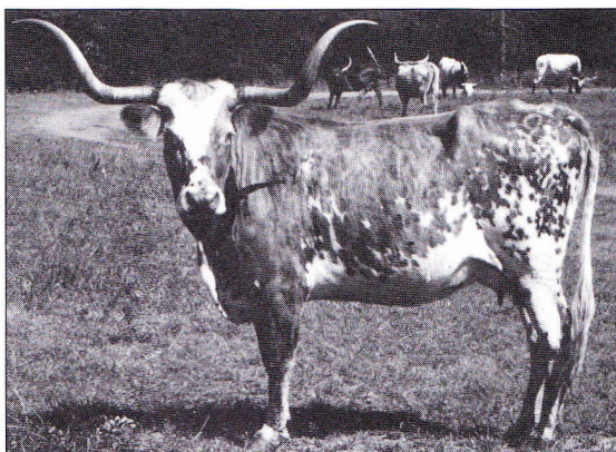
The late WR 1850 is a well-known member of perhaps the most intensely linebred strain of Texas Longhorns—the Wichita Refuge herd. Many of today's WR cattle originate from the 20 individuals (19 cows and one bull) which were the foundation herd on the Refuge in 1927.

The careful reader will have already made the jump from these phenomena within a breed to the situation with using a breed for crossbreeding. When comparing breed to breed, each is like a line of cattle within