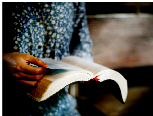
Excerpts from the Lectionary for Mass ©2001, 1998, 1970 CCD. The English translation of Psalm Responses from Lectionary for Mass © 1969, 1981, 1997, International Commission on English in the Liturgy Corporation. All rights reserved.

Acts 4:8-12/Ps 118: 1, 8-9, 21-23, 26, 28, 29 (22)/Jn 3:1-2/Jn 10:11-18