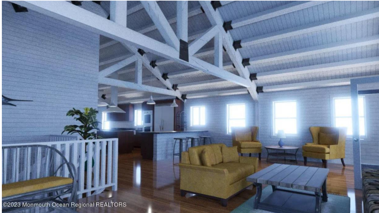
©2023 Monmouth Ocean Regional REALTORS