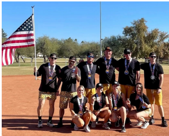
Superstition Firefighters 2022 Kick Ball Champions!

We saw great participation in our flagship event “5K For Heroes” in its 3rd year of 2018 growing by almost 40% in 2019. Through 2020 and the years following the pandemic, up to 2022 we moved to virtual events and fundraisers. The kickball event in 2022 was a great catalyst into 2023 with the announcement of the 5K for Heroes returning in the last quarter of 2023.