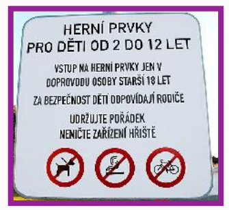
Czech-language sign at the entrance to a children's playground.

Slovakian language since the two countries used to be one country (Czechoslovakia) until their peaceful split in 1993.