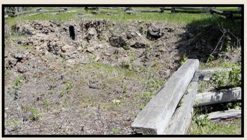
Murphy's Inn was built in 1853 in Eagle Creek Township in east Shakopee. It was a Mecca for visitors from Shakopee and all over the area. They had a wooden floor for dancing, and good drink, and conversation, it was a a fun place to be. By 1900, the inn was abandoned, but in 1936 it was used for the National Youth Administration. In 1947, it was emergency housing, and by 1956 the inn, now part of the city of Shakopee, was torn down. The Landing in Shakopee has the foundation of the Murphy's Inn.

The US government's policy of assimilation would effectively destroy the traditional cultural identities of Native American nations. Many historians have argued that the US government believed that if Native people did not adopt European American culture, they would become extinct as a people. This paternalistic attitude influenced interactions between the Dakota and the US government throughout the first half of the 1800s, and its effects continue to be felt today.