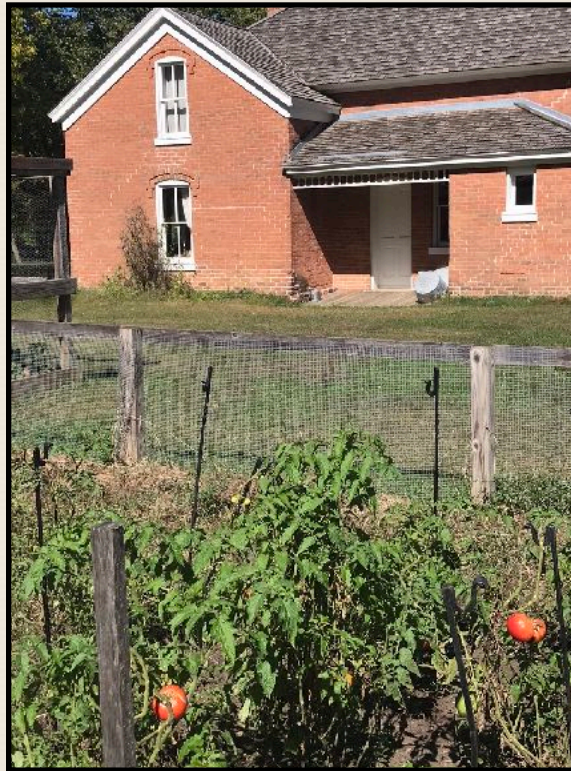
The Connor house is now at The Landing in Shakopee.