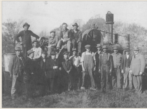
Threshers in Shakopee ca. 1910