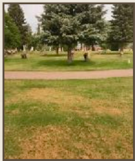
Valley Cemetery