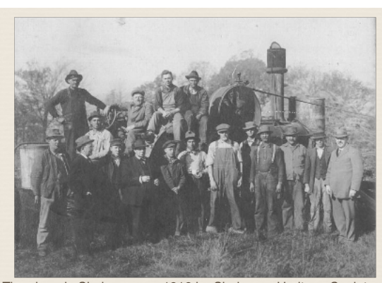
Threshers in Shakopee ca. 1910