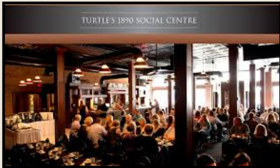
Rock Spring Café is now the Turtle's 1890 Social Centre in downtown Shakopee.