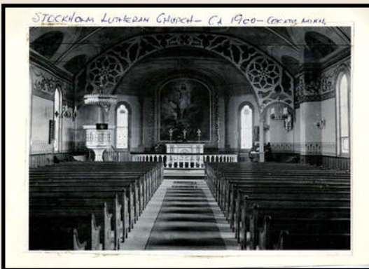
Stockholm Lutheran Church 1916