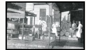
The Northern Pine Pickling Company Plant in West Shakopee was the busiest place in Shakopee in the fall of 1931. Thirty-one people were busy time of weighing, sorting, salting, and barreling thousands of pounds of pickles. Gedney in Chaska also was a place that Mexican Americans would work.