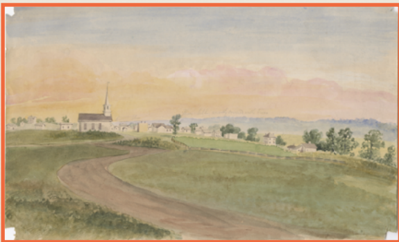
Shakopee ca 1858 Edwin Whitefield.

Helen had “a furious and ungovernable temper wholly unsuitable to domestic peace or enjoyment, that she frequently used abusive and vituperative language and would frequently with profane oaths and other improper language for a lady.”