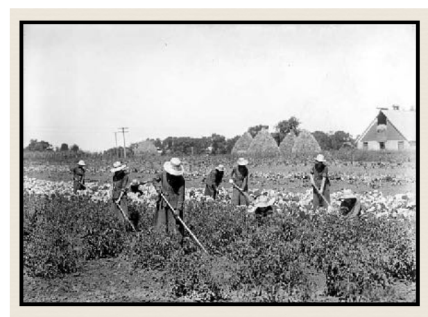
Women working on the farm at the State Reformatory for Women. 1920.

As a result of her work, the bill to create a women's prison in Shakopee finally happened. They purchased 167 acres of land what was then at the edge of Shakopee.