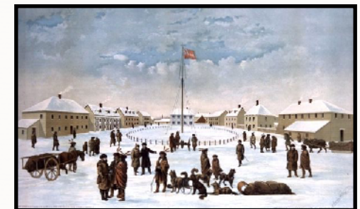
Fort Garry in Winnipeg

“The snow was from eight to twelve inches deep and the bleak and desolate prairies were continually swept by blinding blizzards. Making their way over the frozen ground in forced marches half frozen and blinded by the pitiless storm, the little band reached Pembina on Nov. 13, 1863. It was not until the middle of December, in 1863, that a little detachment of picked men started out to