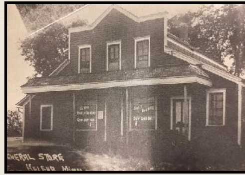
Helena Township in Scott County, Minnesota.