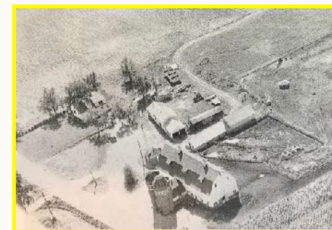
The family farm near Marystown, Minnesota.