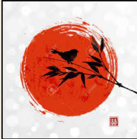
SUMI-E is the Japanese word for Black Ink Painting. East Asian Painting and writing developed together in ancient China using the same materials —brush and ink on paper. Emphasis is placed on the beauty of each individual stroke of the brush.