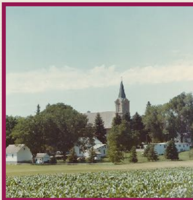
St. Mary's Purification Catholic Church is in Marystown. On the right is the cornerstone from the church from 1882.

“Because of Tettingen's location close to the Moselle River, many immigrants followed the stream to LeHarvre France, and left the continent from there. They would have arrived in the port of New York, going overland to Chicago, and on to Galena, Illinois, where they traveled up the Mississippi River to St. Paul. From St. Paul, it would have been on to Shakopee via