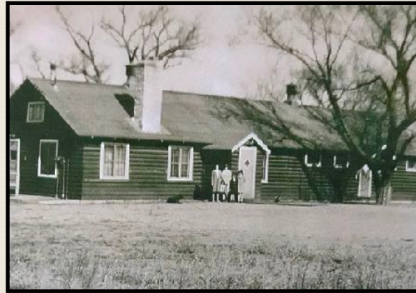
The Mill Pond in downtown Shakopee. This was also a gambling house in the 1920s-1940s.