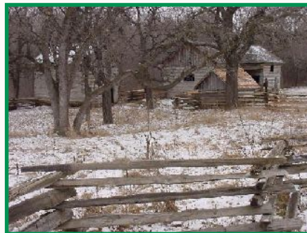
The Landing in Shakopee.