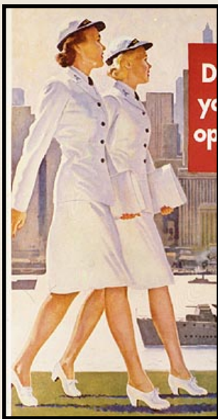
World War II recruiting poster showcasing the summer uniform

She was honored to be a member of the 'Greatest Generation'.