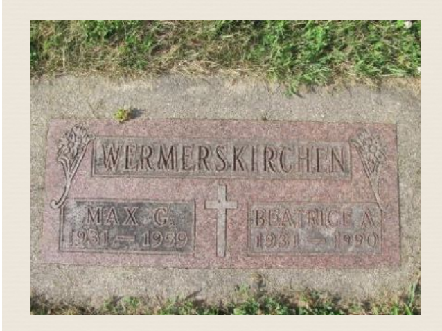
Max Wermerskirchen is at the Catholic Cemetery in Shakopee.