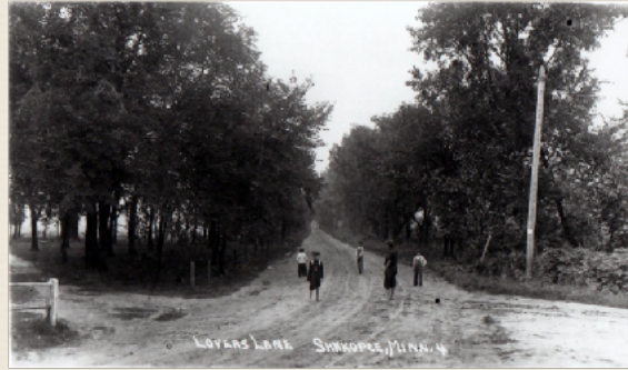
Young Dakota children on the north side of the Minnesota River, in what was later called Lover's Lane.