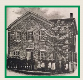
District 41 in 1870

"We had three children when I left St. Paul to seek work here, and my wife remained in St.