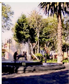
Fountain depicting the drinking coyotes that gave the town its name at the Jardín Centenario.

Coyoacán is a borough in Mexico City. The name comes from Nahuatl and most likely means place of coyotes , when the Aztecs named a pre-Hispanic village on the southern shore of Lake Texcoco dominated by the Tepanec people. Against Aztec domination, these people welcomed Hernán Cortés and the