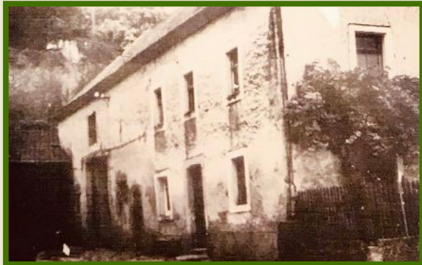
The Sames home in Brück, Bernkastel-Wittlich, Rhineland-Palatinate, Germany.