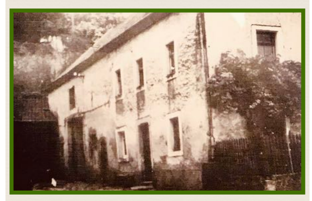
The Sames home in Brück, Bernkastel-Wittlich, Rhineland-Palatinate, Germany.