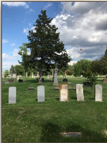
Pond family tombstones at the Valley Cemetery in Shakopee.