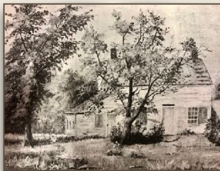
Pond Mission House in Prairieville by unknown painter.