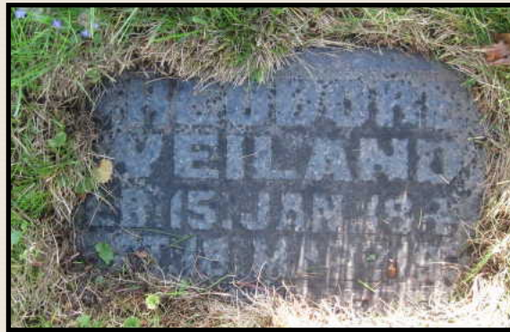
Theodore Weiland is buried at the Catholic Cemetery on 10th Avenue in Shakopee.