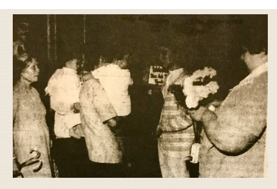
Parishioners from St. Mary's Church welcomes the family from Vietnam. On left is a picture of the family from the St. Mary's booklet.