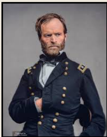
General William Tecumseh Sherman