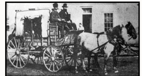
A stagecoach, not from Shakopee.

A cheer arose and General Sherman put his hand out of the window to acknowledge the greeting.