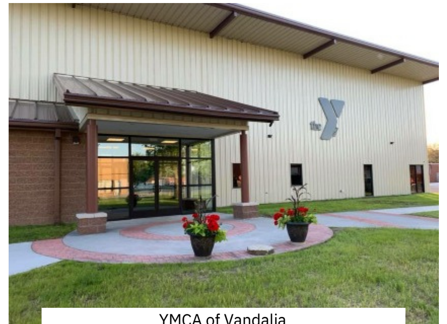
YMCA of Vandalia Hours: Monday - Thursday - 6am-8pm Friday - 6am-7pm, Saturday - 7am-4pm, Sunday - 1-5pm

Additionally, Chiropractor, optometrist, dentist and hearing clinic technician all have offices here in Vandalia.