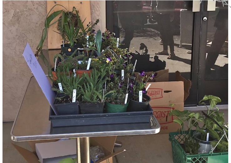
The Swap Meet raised over $400 - much of it designated for the RVGC Operating Budget and other committees.