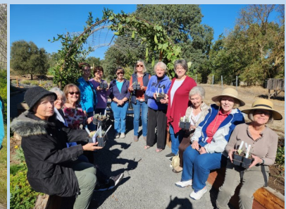
Touring the Wilton Family Lavender Farm brought out lots of members!