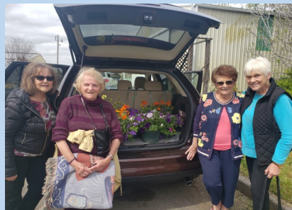
We always pack our trunks full when we visit the Hollandale Farm in Lodi

Many thanks to you, our members, for taking part in these activities.